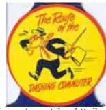
Logo, Long Island Railroad