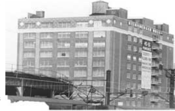
Sternberger Warehouse showing sign advertising available space

Sternberger Esbitco Warehouse, located at 45-55 Pearson Street, Long Island City, was known as Spot 9 according to page 1 of Maps of Freight Stations and Private Sidings published in June 1966. Your author surmizes switching crews did not actually use these spot numbers to identify these industries as the map book previously referred to has not assigned unique spot numbers to each industry - the Spot numbers are "recycled", so to speak, on different maps. This 1966 publication puts Sternberger facing Yard A. According to this track plan, Sternberger is immediately east of C.J. Slicken but I suspect Slicken (Spot 8) was simply a co-tenant in 45-55 Pearson Street. According to the Hyde Atlas , Queens Vol. 1, updated through 1955, this building, then known as "Ludwig Bauman Warehouse" was situated west of the Queens County Court House and was bounded by Court Square and Pearson Street. Prior to that it was Ludwig-Bauman Co. It would be interesting to learn when this warehouse was built - can any of our readers assist in this regard? According to a Robert Emery map, Sternberger was served by a siding that ran alongside this building. Fabrizio believes two sidings ran into the building.