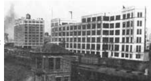
Sternberger seen in the context of neighboring Peter Mallon building

Forty-five fifty-five Pearson Street appears to be a ten-story tan brick building with 20,000 square foot floors. Sternberger may have been roughly 160 feet wide and 120 feet deep. In the 1960s, a script "LB" graced its fascia. A 1939 photograph from the Carl Fabrizio Collection shows the name Ludwig Bauman spelled around three sides of this structure from about the second story and up. Fabrizio notes that there was another logo painted on its façade during the post-war forties. A lighter color broad horizontal band above its ninth floor distinguishes this building. A wooden water tank graces its roof. Can anyone tell us what name to apply to the three roof structures almost apparent from trackside? Also noteworthy is Sternberger's external fire escape.