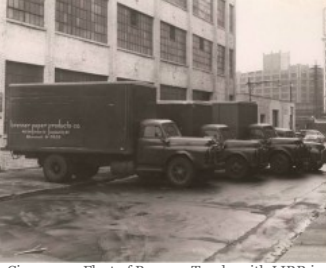
Circa 1950, Fleet of Brenner Trucks with LIRR in background. American Steel Wool shared the same building.

facility, occupied a white 5-story brick building topped by a red sign with white letters that read "AMERICAN STEEL WOOL", appears on page 5 of Penn Central Color Guide to Freight and Passenger Equipment . It has a separate tall square smoke stack to its west side. Further to its west and fronting Queen Street, an adjacent, related, one-story building painted white had also been occupied by FADA Radio Co. The Long Island Rail Road 2002 Calendar (March) shows a box car spotted at this one-story building in the 1950s. In 1966, American Steel Wool shared both a building and siding with Brenner Paper Corp. Brenner's spot (12A) was to the east of American Steel Wool. That siding is not in service today.