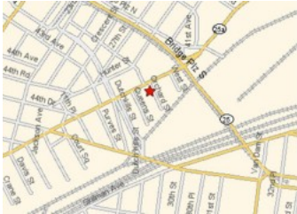
Street map of Long Island City with American Steel Wool location indicated by a red star.