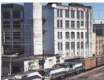
American Steel Wool Building

facility, occupied a white 5-story brick building topped by a red sign with white letters that read "AMERICAN STEEL WOOL", appears on page 5 of Penn Central Color Guide to Freight and Passenger Equipment . It has a separate tall square smoke stack to its west side. Further to its west and fronting Queen Street, an adjacent, related, one-story building painted white had also been occupied by FADA Radio Co. The Long Island Rail Road 2002 Calendar (March) shows a box car spotted at this one-story building in the 1950s. In 1966, American Steel Wool shared both a building and siding with Brenner Paper Corp. Brenner's spot (12A) was to the east of American Steel Wool. That siding is not in service today.