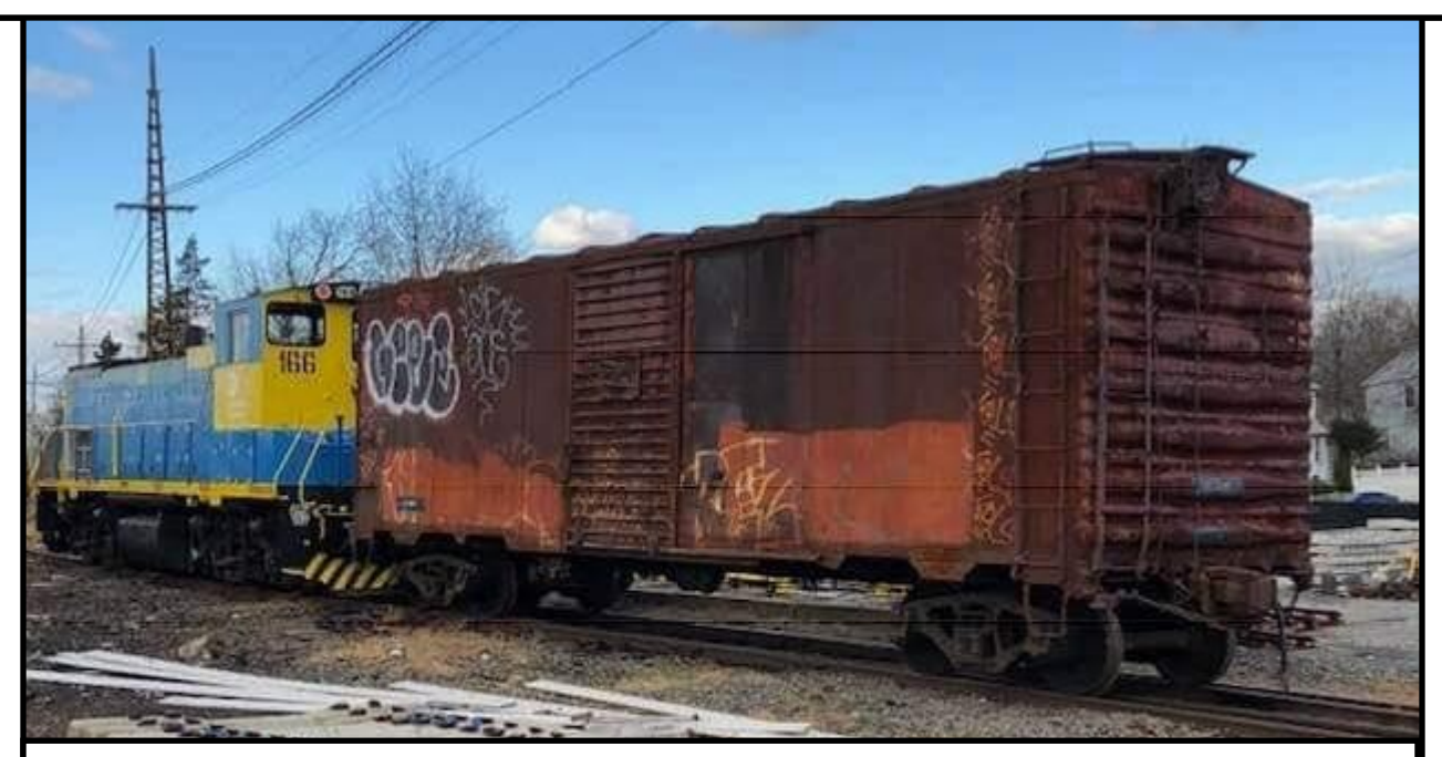
On a brighter note, ex-NYNH&H PS-1 boxcar #32006 was also relocated to Dunkirk Street Yard. But rather than being scrapped, this car will be loaded onto a tractor Trailer and moved to the Oyster Bay Railroad Museum. There it will be restored and serve as a historic display and storage container.

The LIRR is cleaning house. Three hacks, including N-5 #2, were loaded onto flat cars on December 6th to be shipped off the island and scrapped. They had long been stored at Holban Yard, and in the Morris Park Bone Yard prior to that. A couple old B&M coaches from Dunkirk Street Yard were loaded up for scrap as well.