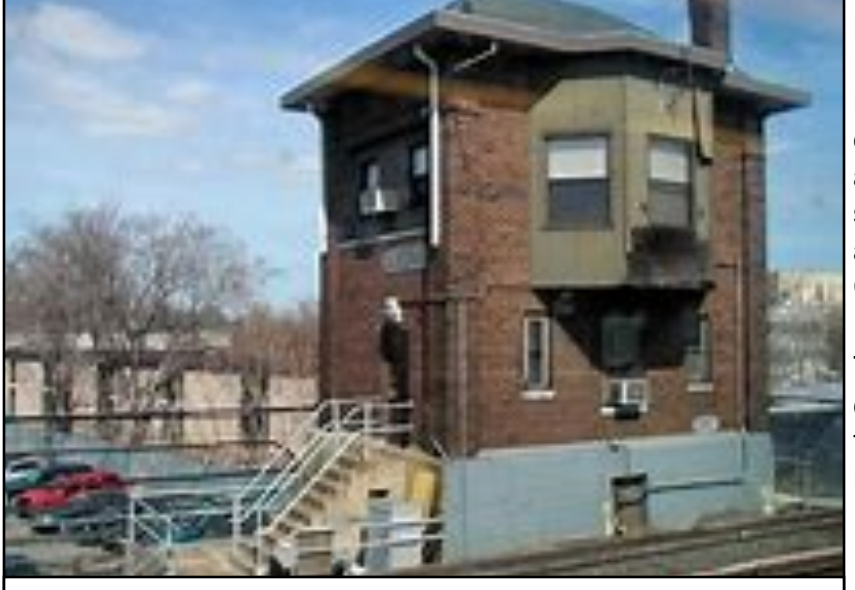
Queens Tower

The LIRR proposal to eliminate on board cash transactions for the purchase of tickets has been temporarily shelved. More on this next month.