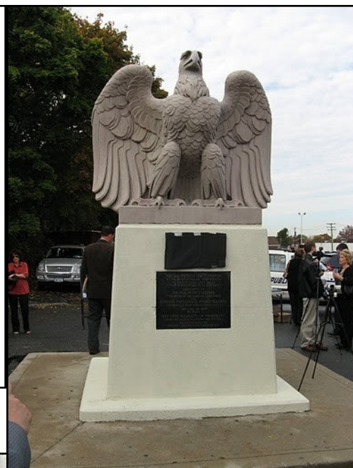
The eagle with the newly affixed plaque shown at left