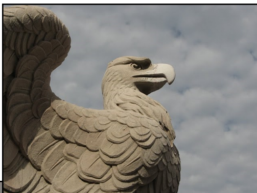
Hicksville Eagle showing off the new beak during the ceremony

Until then, happy modeling! and Happy Thanksgiving!