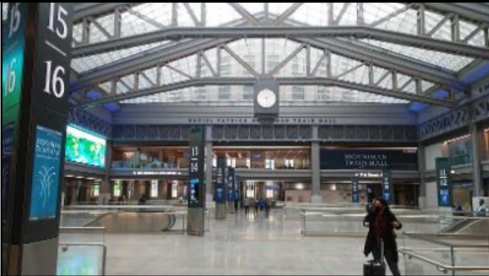
The Main Hall Looking South