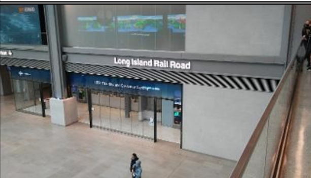
LIRR Ticketing from 2nd Level