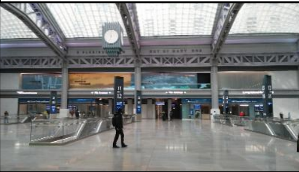
The Main Hall Looking West