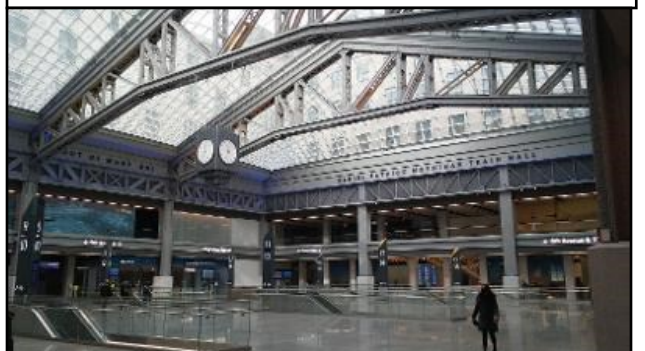
The Main Hall Looking Northwest