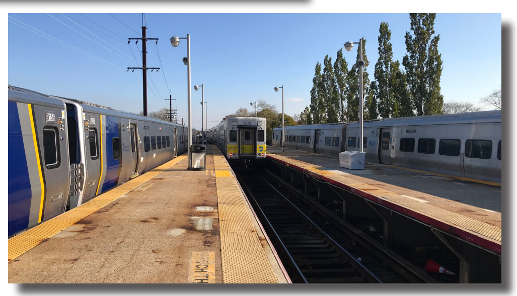
An M-9, C-3 and an M-7 in Babylon station