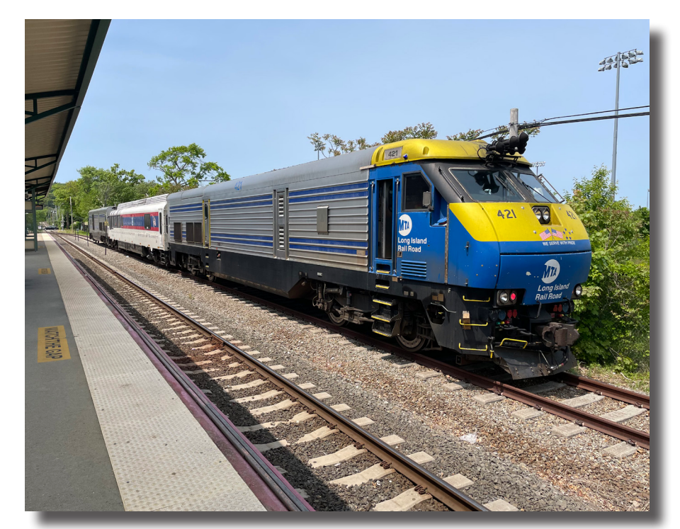
FRA train on LIRR tracks