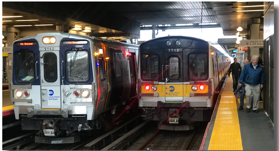
An M-9 and an M-7 in Jamaica station