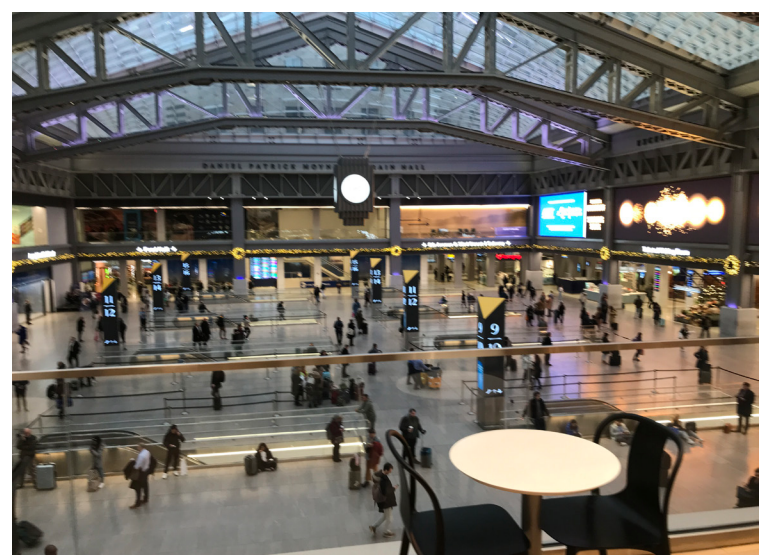
Moynihan Train Hall

PLEASE SEND ME YOUR EMAIL ADDRESS AND I WILL EMAIL YOU THE SEMAPHORE WITH COLOR PICTURES!